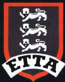
Table Tennis News